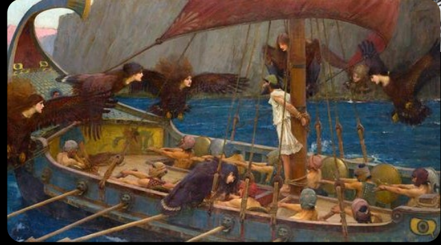
8th Century BC