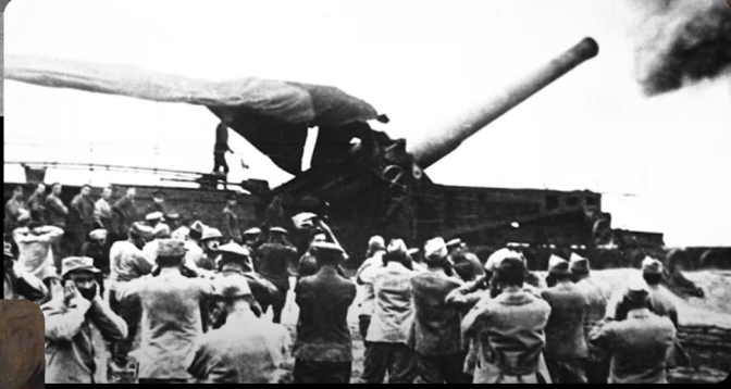
1864 First Earplug Patent